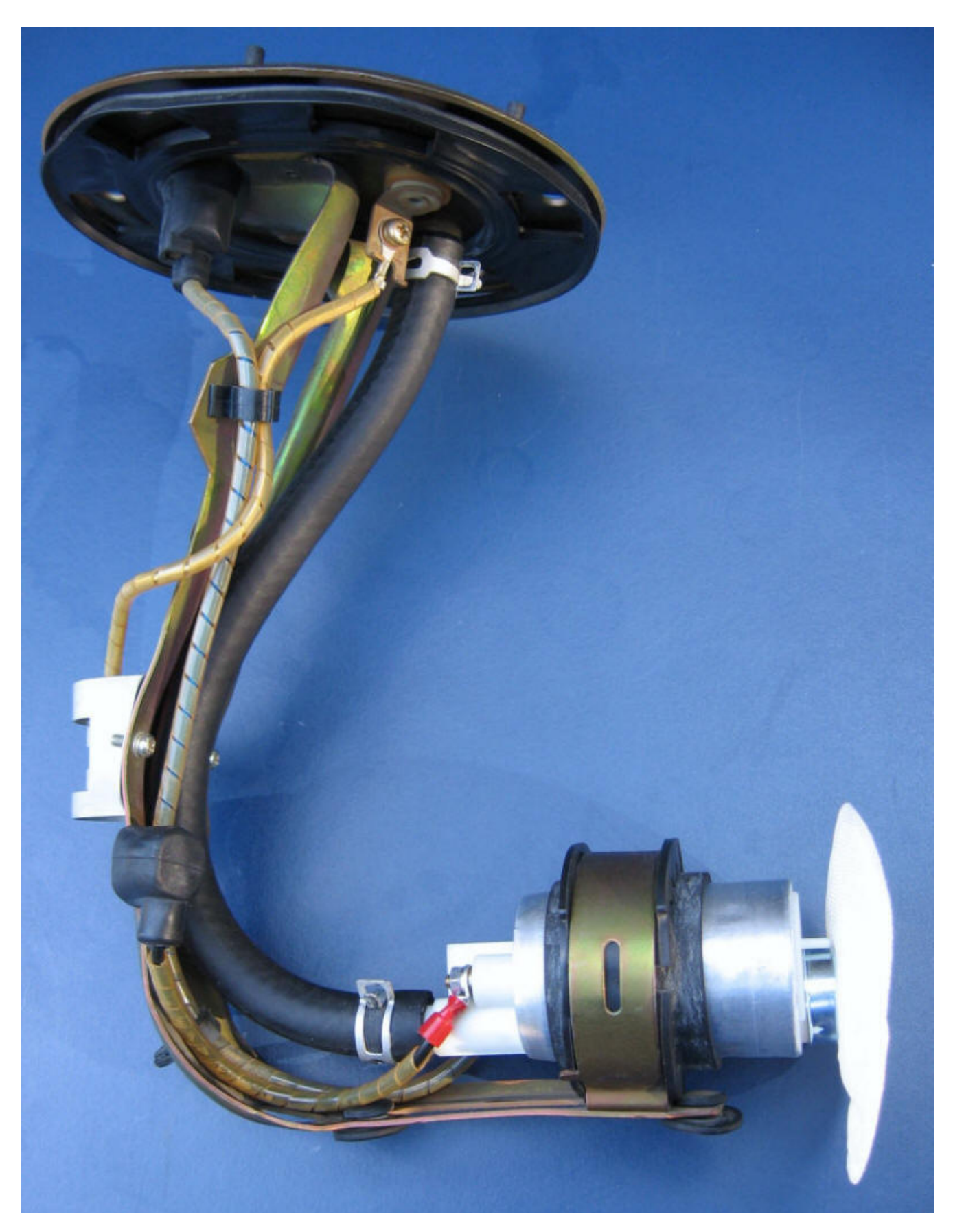
I think this picture pretty much tells the rest of the story.